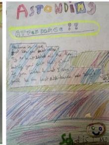
By Ellie (4B)