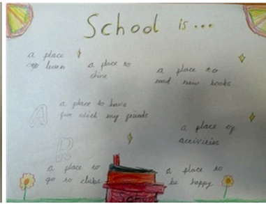
By Neve (Acacia)